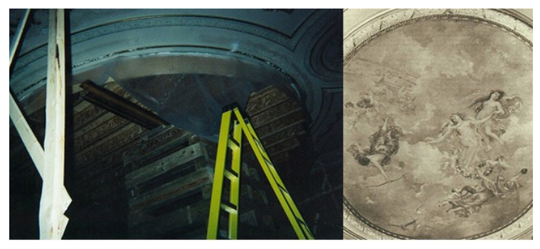
This castle in Pennsylvania has a 100 year old French ceiling painting. W. A. designed and built the equipment to lower the painting from the 20 foot high ceiling. Once the restoration of the painting was complete, we returned it back to its place on the ceiling.